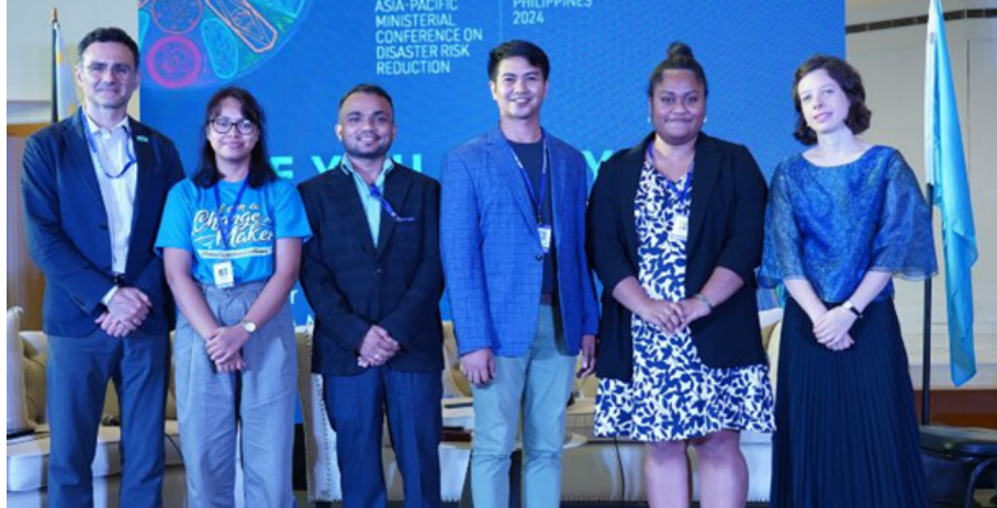
Panelists highlight how to empower youth to lead the way in emergency preparedness, emphasizing the key principles of the global agreement on disaster risk reduction.