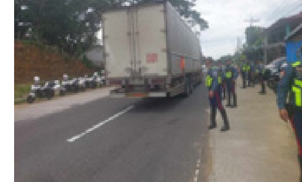
To address the aftermath of Severe Tropical Storm "Kristine" in the Bicol Region, the Regional Highway