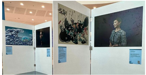
The "Are You Ready?" art exhibition highlights the stories of the 2004 Indian tsunami survivors.