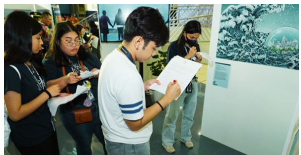
Students complete a questionnaire reflecting on the art exhibit.

DRR in schools. Panelists discussed the Comprehensive School Safety Framework 2022-2030 and the necessity of empowering the youth to contribute to DRR strategies. Participants emphasized the importance of knowledge and skills-building among students specifically on disaster preparedness.