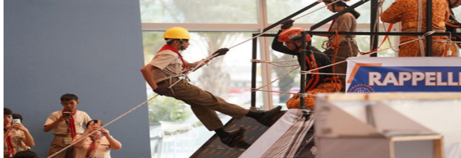
Future generations prepare for emergencies by learning survival techniques in a simulated disaster.

about disaster preparedness, the Asia-Pacific region can work towards a future where communities are better equipped to mitigate the impacts of disasters and help shape a better future for all.