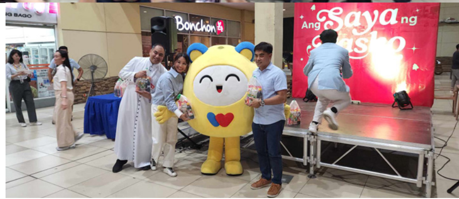
Feel the Magic of Christmas at Walmart Makiling. With the dazzling tree now aglow, Walmart Makiling invites everyone to explore its Holiday SALE, Christmas MARKET, and the Handog PAMASKO program. Experience why “ANG SAYA NG PASKO sa WALTERMART” truly shines brightest at Walmart. Visit today and make your holidays magical!