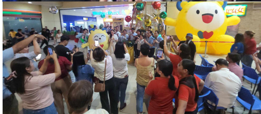
Calamba City, Laguna – The holiday season is officially in full swing as Walmart Makiling held its much-anticipated Christmas Tree Lighting Ceremony today, marking the start of its festive campaign, “ANG SAYA NG PASKO sa WALTERMART!” The Christmas Tree Lighting event also served as a moment to honor beneficiaries, showcasing Walmart’s commitment to sharing joy with the less fortunate.