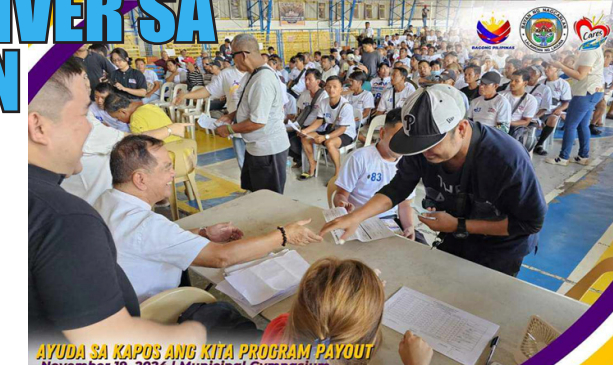
AYUDA SA KAPOS ANG KITA PROGRAM PAYOUT November 19, 2024 | Municipal Gymnasium

Kapos ang Kita Program AKAP ay isang bagong programa ng DSWD na layong mabigyan ng tulong ang mga Pilipinong