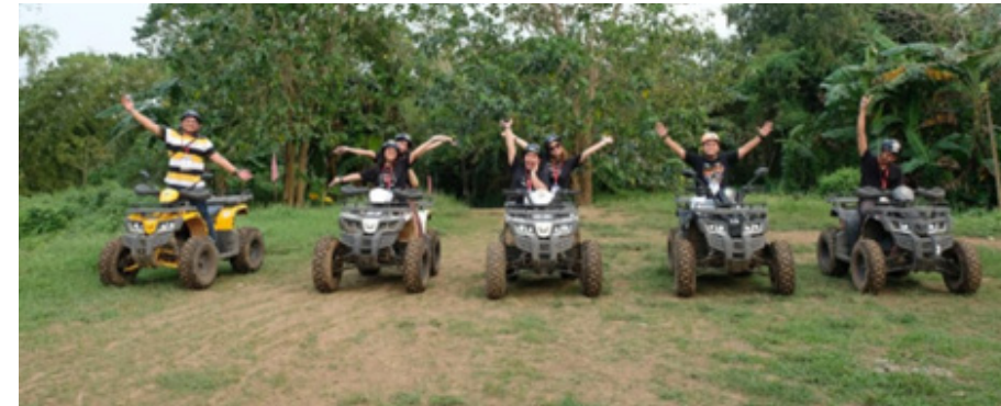
ATV in action at Paraiso de June Quixote