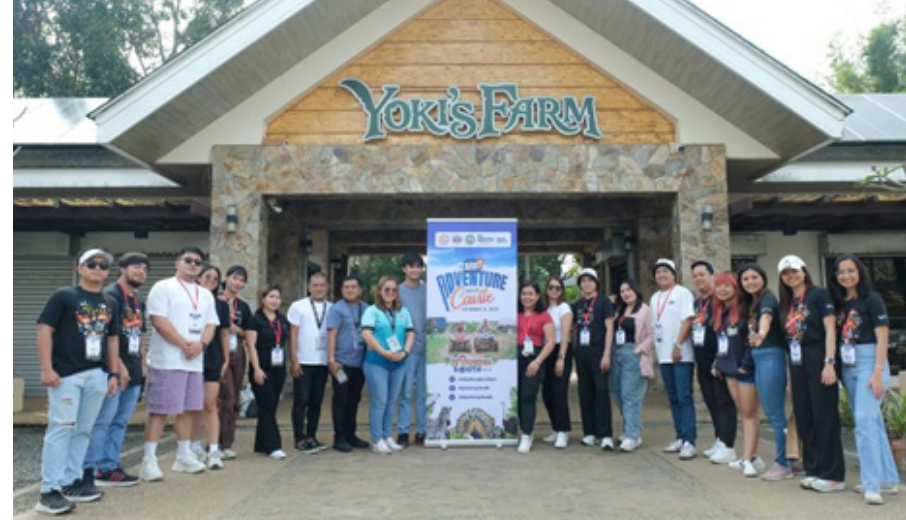
Adventure at Yoki's Farm

A select group of lucky Ka-Biyaheros—energetic Gen Zs and millennials—were chosen through an online raffle hosted on the Biyaheng South Facebook page. Together with other travel influencers, the adventurers embarked on an unforgettable day packed with thrilling experiences and scenic wonders.