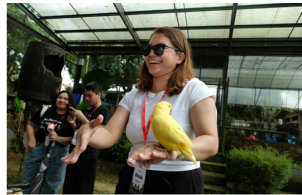
Animal encounter at Yoki's farm

Yoki's Farm is a unique ecotourism destination located in Mendez-Nuñez, Cavite. Adventurers were treated to a guided zoo tour where they interacted with a variety of animals, such as delightful rabbits, unique