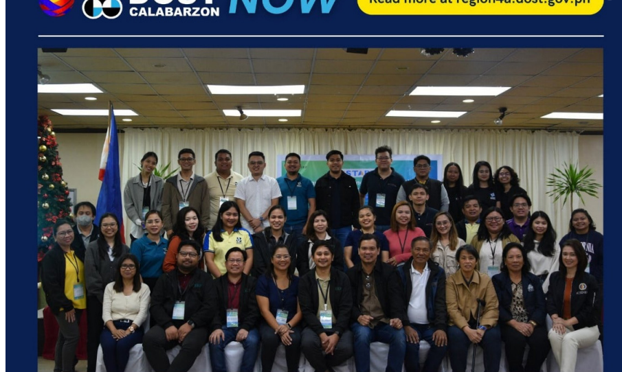
December 3-5, 2024 DOST-CALABARZON LAUNCHES 3-DAY ISTART CAPACITY BUILDING TO EMPOWER REGIONAL AND PROVINCIAL STAFF Monte Vista Hostsprings & Conference Resort, Calamba City, Laguna

The Department of Science and Technology (DOST) CALABARZON brought together heads and staff for a 3-day workshop that aims to capacitate its Provincial Science Technology Offices (PSTOs) and various units in the regional office in implementing the Innovation, Science, and Technology Accelerating Regional Technology-Based Development (iSTART). This workshop is set to happen from December 3-5, 2024 at the Monte Vista Hostsprings & Conference Resort, Calamba City, Laguna. The event marks the start of Phase 2 of the iSTART project, which focuses on equipping the participants with STI-based tools and strategies needed to guide LGUs in crafting development plans, particularly the Comprehensive Development Plan (CDP) and Provincial Development and Physical Framework Plan (PDPFP).