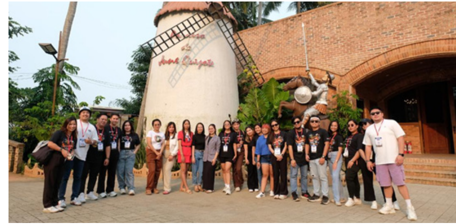
Adventure at Paraiso de June Quixote

Maragondon Balsa River Cruise for lunch—just an hour away from Yoki's Farm—where they were treated to a unique and memorable dining experience. As the balsa gently floated along the calm river, the participants immersed themselves in the natural beauty of their surroundings, allowing everyone to unwind and connect with one another.