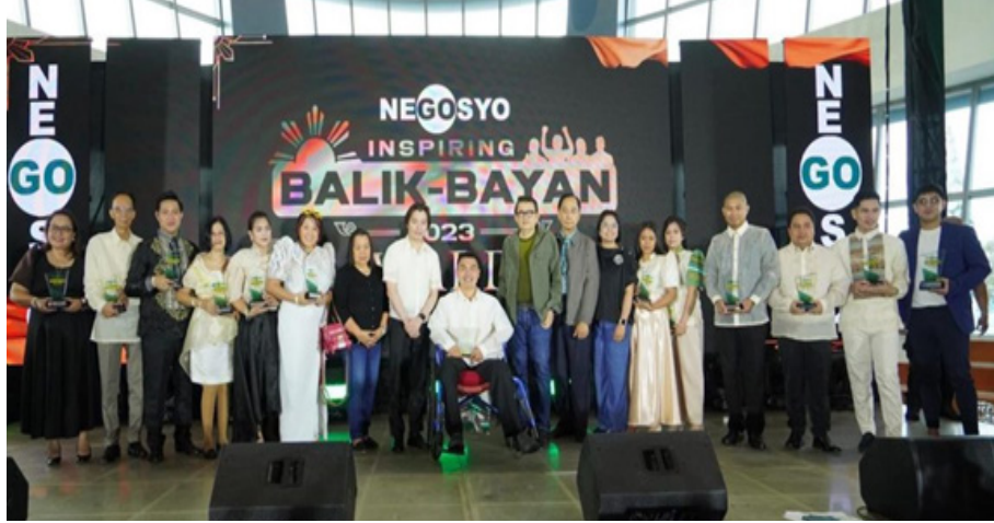
Go Negosyo Balik-Bayan 2023 Awardees

OFWs who have successfully founded their own businesses here in the Philippines are being encouraged to share their entrepreneurship journey via the 2024 Inspiring Balik-Bayan Awards. The annual award is organized by Go Negosyo to recognize the contributions of OFWs (Overseas Filipino Workers), share their success stories, celebrate the achievements of OFWs-turned-entrepreneurs, and foster entrepreneurial aspirations among current OFWs.