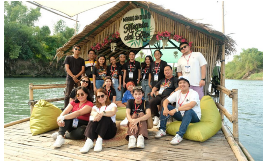
Adventure at Alegria del Rio, Maragondon River Cruise Second Adventure: Lunch at Maragondon Balsa River Cruise

birds, exotic zebras, and more. Definitely an enjoyable experience, especially for animal lovers. Overall, Yoki's Farm served as both an educational and recreational spot for the participants.