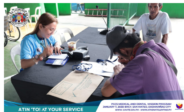
ATIN 'TO! AT YOUR SERVICE PGCS MEDICAL AND DENTAL MISSION PROGRAM JANUARY 7, 2025| BRGY. SAN MATEO, DASMARIÑAS CITY WWW.CAVITE.GOV.PH - WWW.ATHENATOLENTINO.PH

In the opening salvo of the Provincial Government of Cavite's medical outreach on January 7, 2025, the residents of Brgy. San Mateo in the City of Dasmariñas were given access to free medical and dental services in a highly successful medical and mission. A total of 393 residents benefited from the initiative, with