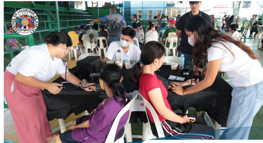
ATIN 'TO! AT YOUR SERVICE PGCS MEDICAL AND DENTAL MISSION PROGRAM JANUARY 7, 2025| BRGY. SAN MATEO, DASMARIÑAS CITY WWW.CAVITE.GOV.PH - WWW.ATHENATOLENTINO.PH