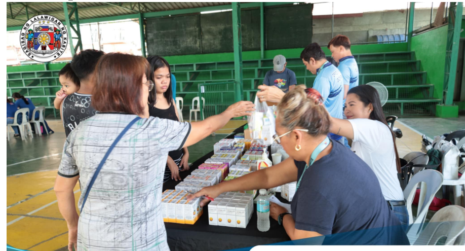
ATIN 'TO! AT YOUR SERVICE PGCS MEDICAL AND DENTAL MISSION PROGRAM JANUARY 7, 2025| BRGY. SAN MATEO, DASMARIÑAS CITY WWW.CAVITE.GOV.PH - WWW.ATHENATOLENTINO.PH