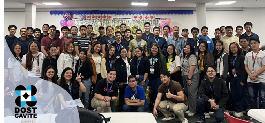
- Cavite Plant Employees on Hazard Analysis and Critical Control Points (HACCP)