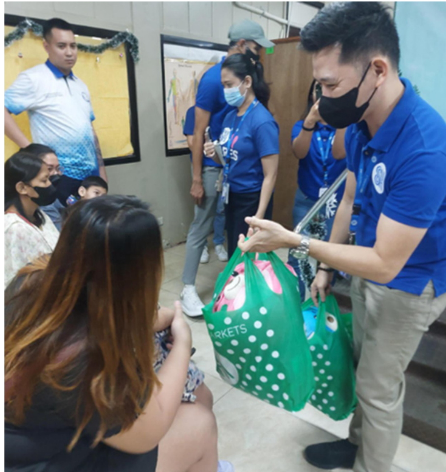
Giving back this holiday season, SM Center San Pedro brings joy to children of Physical Medicine and Rehabilitation Unit - San Pedro City with Bears of Joy.