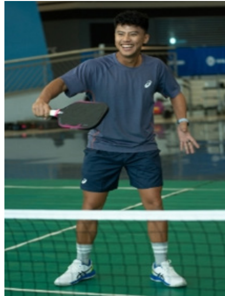
The SM Active Hub, the Philippines' largest sports playground, invites everyone to move, play, and experience ultimate sports fun at its March 9 launch.