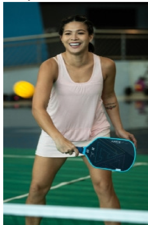
The SM Active Hub extends its reach with 44 pickleball courts in 21 SM malls throughout the country.

SM Active Hub pickleball home courts: SM North EDSA, SM Southmall, SM City Grand Central, SM Seaside City Cebu, SM City Santa Rosa, SM City Molino, SM City Baguio, SM City Valenzuela, SM City Novales, SM City Rosario, SM City Rosales, SM Center Antipolo Downtown, SM City Cabanatuan, SM City Pulilan, SM City Telabastagan, SM City Olongapo Central, SM Center Ormoc, SM City Consolacion, SM City CDO Uptown, SM City Roxas, and SM City Puerto Princesa.