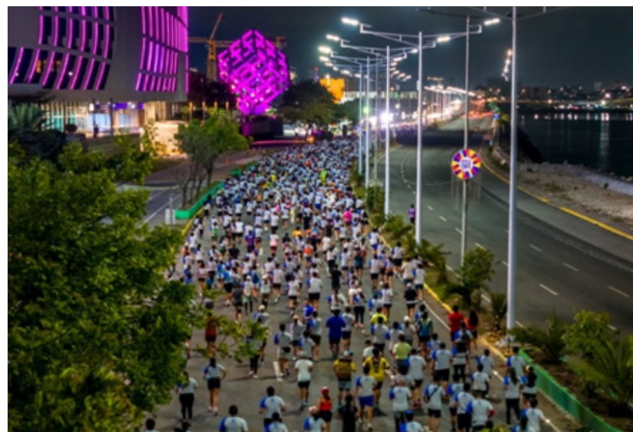
The SM2SM Run in Cebu City promotes community spirit, health, and fitness through the shared passion of running.

is supported by Toby's, Asics, Sports Central, Under Armour, Power Mac Center, Hydroaid, Daily Fix, But First Coffee, and Taters. Join SM Active Hub SM Active Hub is the premier sports and