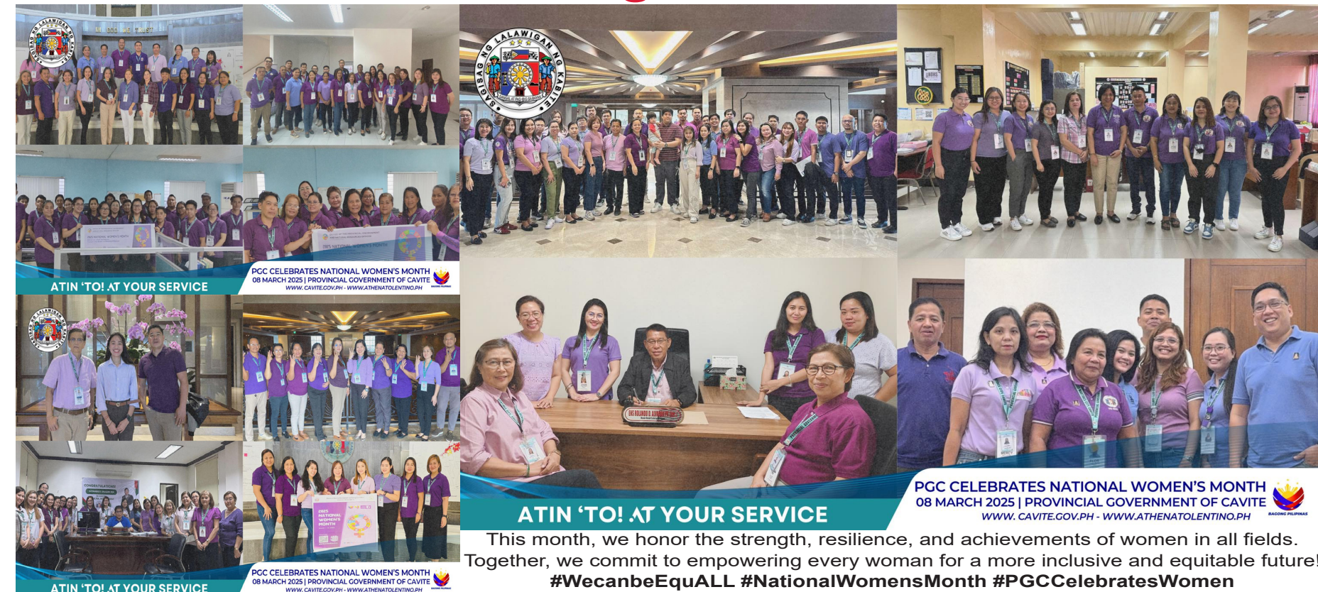
ATIN 'TO! AT YOUR SERVICE