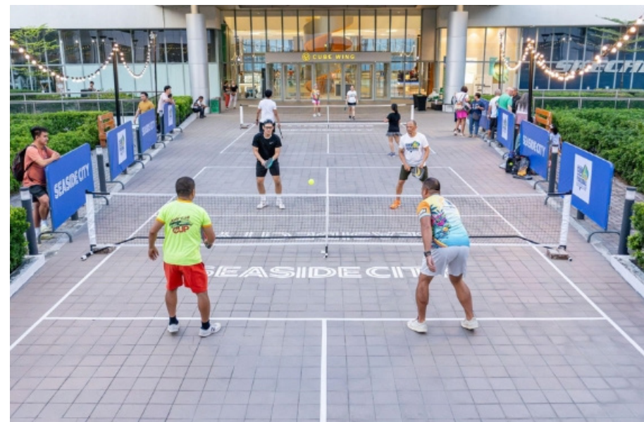
Pickleball, a blend of tennis, badminton, and table tennis played with paddles and a perforated ball, offers an easy-to-learn activity for all ages.

And this is just the beginning! SM Active Hub is only getting started with running and pickleball, with more venues and thrilling sports experiences coming your way. Stay tuned for the next wave of action!