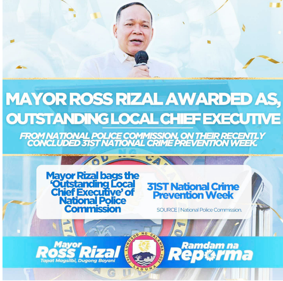
Calamba City Mayor Roseller "Ross" H. Rizal has been recognized by the National Police Commission (NAPOLCOM) as an Outstanding Local Chief Executive during the celebration of the 31st National Crime Prevention Week. Mayor Rizal expressed his gratitude,