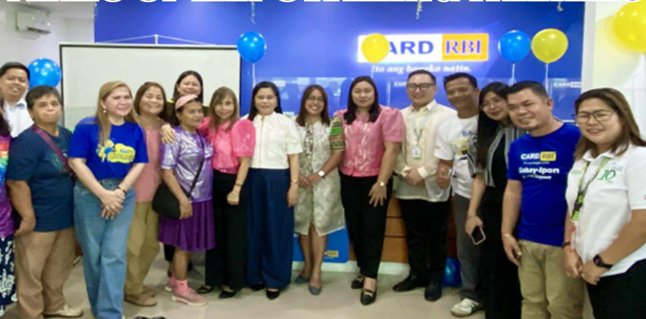
CARD RBI heads, staff, and clients, along with CARD MRI Senior Advisers, unite to commemorate the institution's 13th founding anniversary.

CARD MRI Rizal Bank, Inc. (CARD RBI), a microfinance-oriented rural bank under the CARD Mutually Reinforcing Institutions (CARD MRI), celebrated its 13 years of strengthening banking through innovative technology and a commitment to a sustainable future in Sta. Cruz, Laguna, on October 11, 2025.