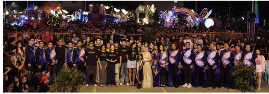
CITY OF DASMARIÑAS — The city sparkled with vibrant colors as the much-awaited Lighted Float Parade illuminated the streets, remaining one of the most anticipated highlights of the Paruparo Festival. This year, eighteen (18) spectacular lighted floats crafted by various businesses and organizations in the City of Dasmariñas proudly paraded through the route, showcasing creativity, craftsmanship, and the city's festive spirit. The celebration concluded with a grand fireworks display and the ceremonial lighting of the giant Christmas tree, marking a magical end to the festivities.