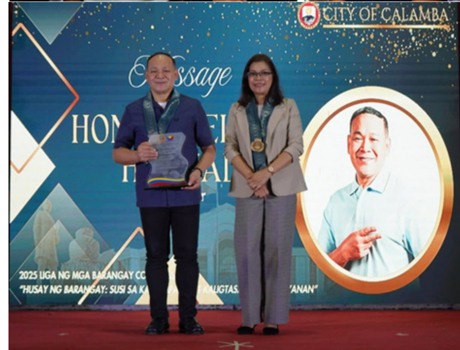
Barangay Congress showcased Calamba City's unified effort to empower communities, celebrate exemplary leadership, and deliver tangible improvements for every resident.