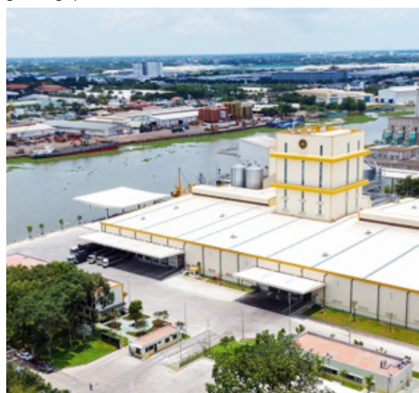
Since 2014, Vietnam has been a key growth market for Aboitiz Foods through Pilmico's acquisition of Vinh Hoan 1 Feed JSC. Most recently, the company further strengthened its presence with a US$45-million feed mill in Long An Province that can produce up to 300,000 metric tons of livestock and animal nutrition feed annually—underscoring the company's commitment to supporting Vietnam's food security and agricultural growth.

The discussions focused on opportunities to support Vietnam's continued economic expansion and strengthen regional competitiveness, particularly in sectors where Aboitiz has established capabilities and a growing presence. President Lam also expressed support for deeper engagement between Vietnamese and Philippine businesses as both countries pursue shared development goals.