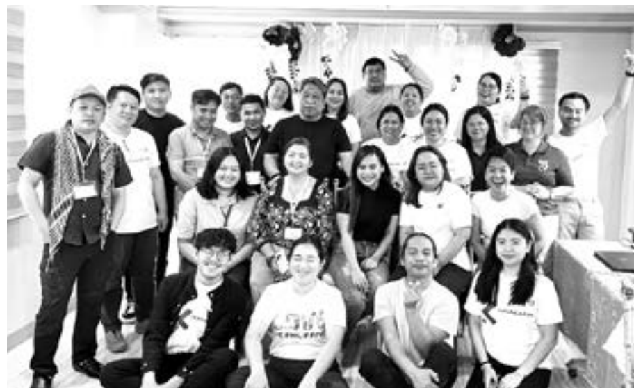
Media participants and CARD MRI key officers gathered for a media briefing to conclude the three-day Panaghiusa CARD MRI Exposure Tour program.

The CARD Mutually Reinforcing Institutions (CARD MRI) invited media practitioners from Laguna, Davao, Leyte, and Samar to participate in its Panaghiusa: CARD MRI Exposure Tour Program in Tacloban City from June 19 to 21, 2024.