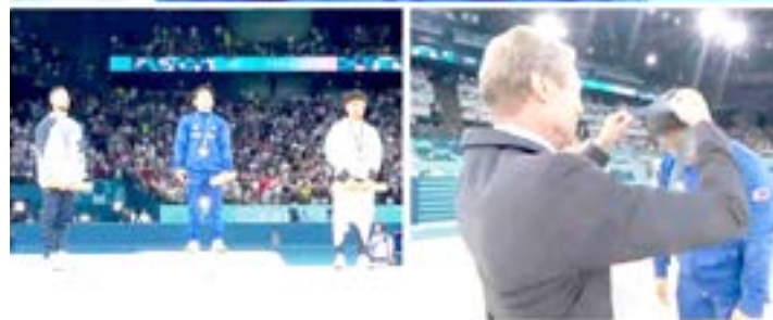
Carlos Yulo Clinches Double Gold at 2024 Paris Olympics