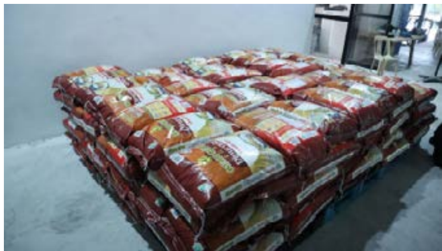
Sacks of rice donated by MPT South and Maynilad